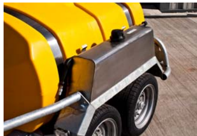
Stainless steel detergent tank & lance holder