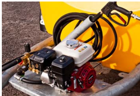
Tough galvanised chassis with handbrake