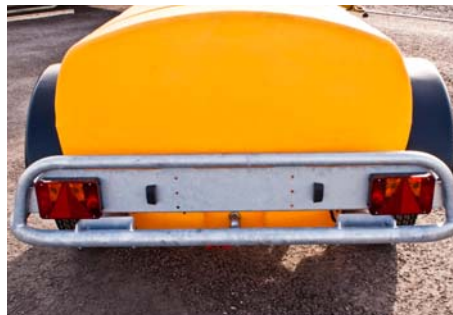
Rear bumper with road legal lighting system