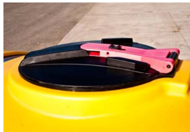
380mm diameter manway into top of tank